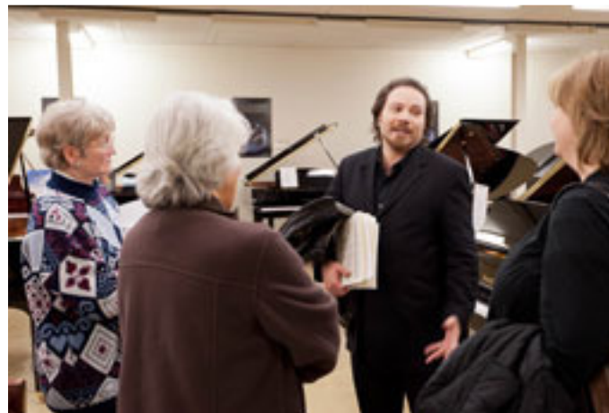
Socializing after a job well done!