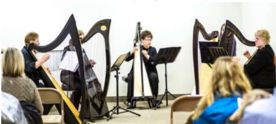
March 2, 2014 – The Tapestry Celtic Harp Ensemble

724 N. Villa Avenue Villa Park, IL 60181 (630) 290-8673 rei@net.elmhurst.edu